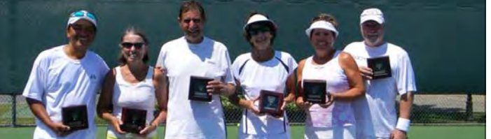
The Riviera Tennis Club